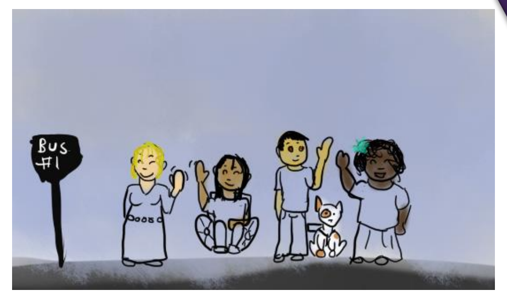
[Above: An illustration by Corbin K. Four smiling people standing and waving. There is a sign reading "Bus #1" next to them.]