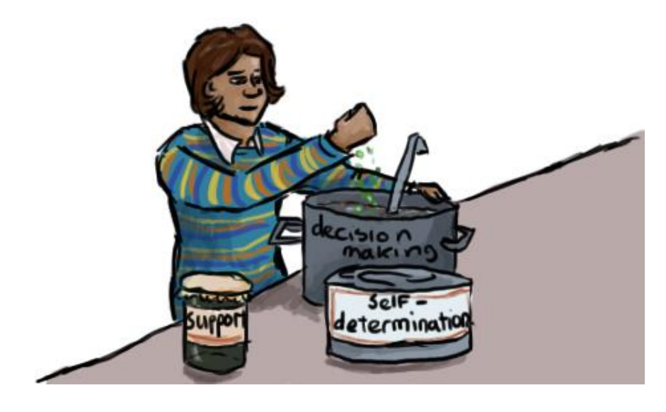
[Above: an illustration by Simone V. A person is cooking for themselves with ingredients labeled "support," "decision making," and "self-determination.]