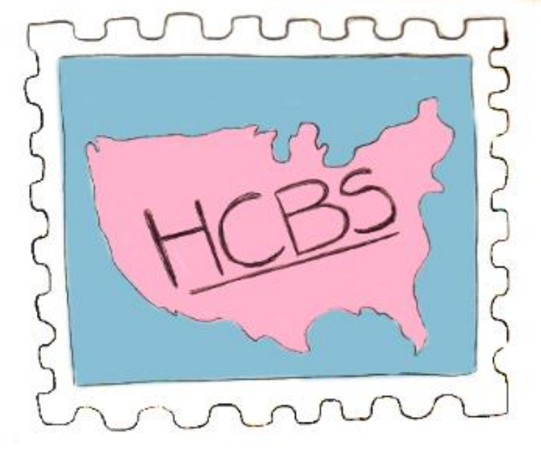
[Above: an illustration by Jo M. A postage stamp with a picture of the United States and the text "HCBS" across it.]