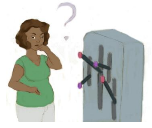
[Above: an illustration by Jo M. A person with a question mark above their head stands looking at a machine with many different levers.]