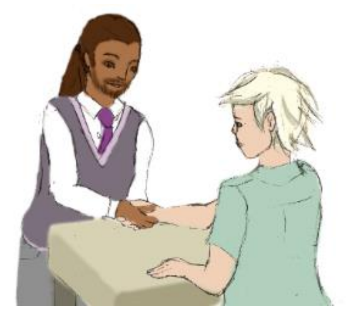
[Above: an illustration by Jo M. Two people are shaking hands over a desk.]