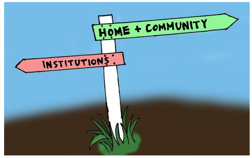
[Above: An illustration by lanthe MBD. Two signs pointing in opposite directions. One is green and labeled "home + community," the other is red and labeled "institutions."